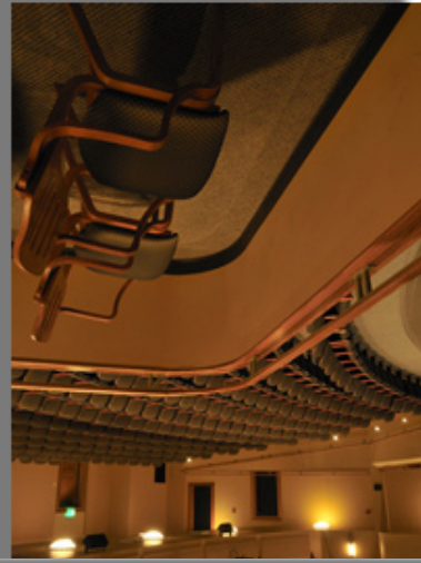
The Montgomery Family Rehearsal Hall