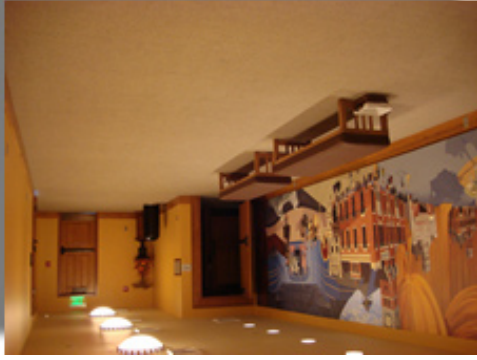
The Crosby Family Lobby