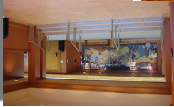
The David and Sylvia Walker Reception Hall

Whether it is the main theatre (left), the reception hall (below), the lobby (bottom) or the rehearsal hall (bottom, left), the C.L. Hoover Opera House in Junction City has the right space to suit your needs. The latest in technology supports the beauty of a building that is at the center of Junction City's history. Choose your room today!